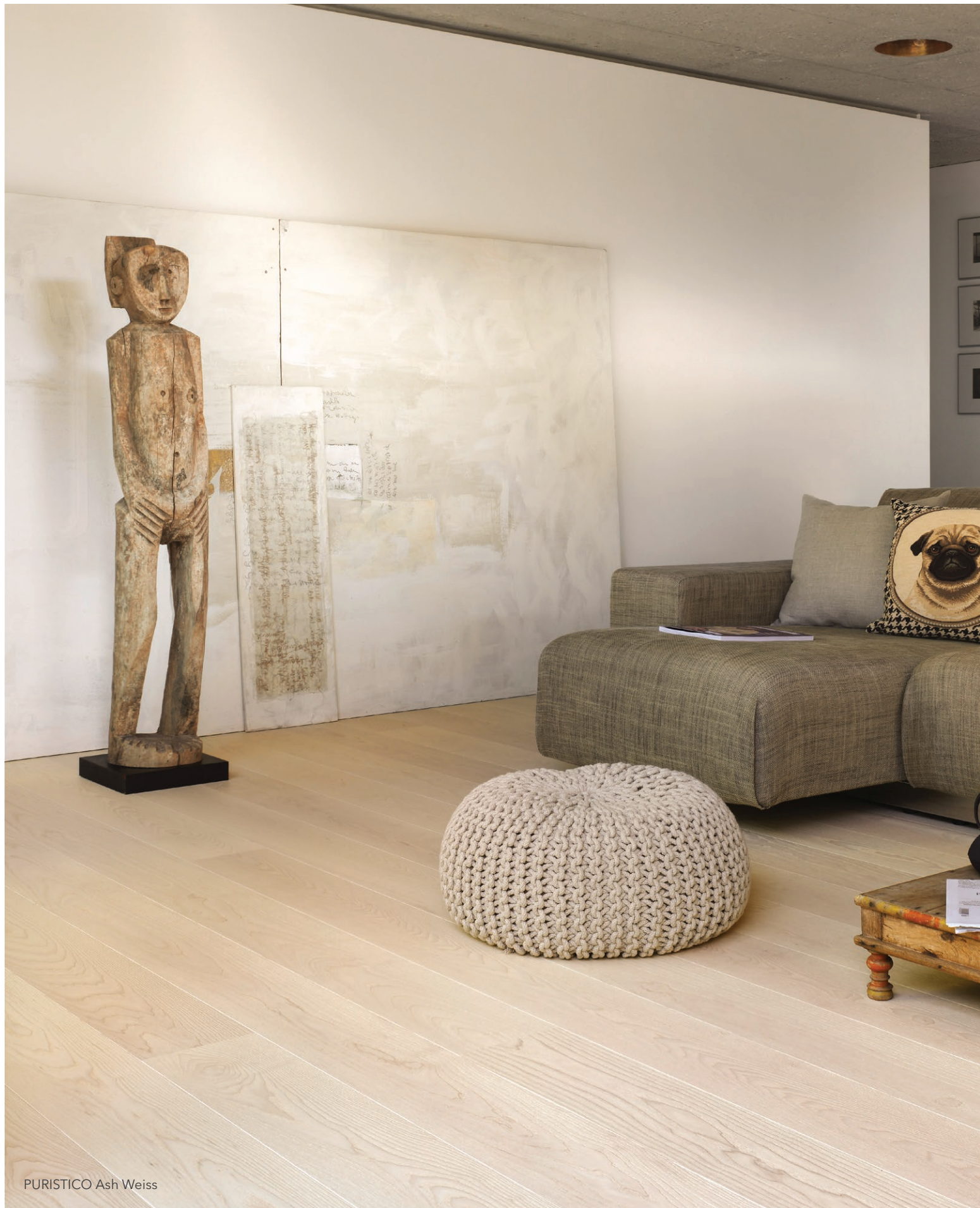
PURISTICO Ash Weiss